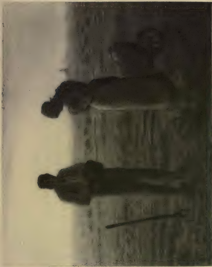
From the collection of the